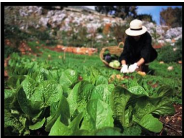
Organic farming at Mitzpe Hayamim