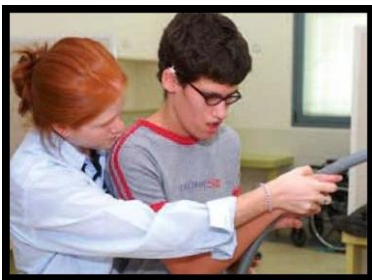
Aleh Negev Rehabilitative Village