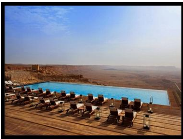
Beresheet Hotel Pool