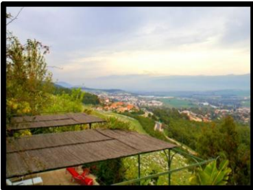
Mitzpe Hayamim view