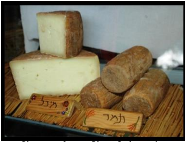
Cheese from Shai Seltzer's Goat Farm