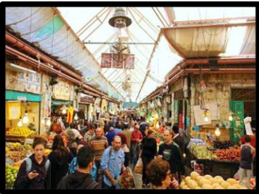
Maheneh Yehuda Market