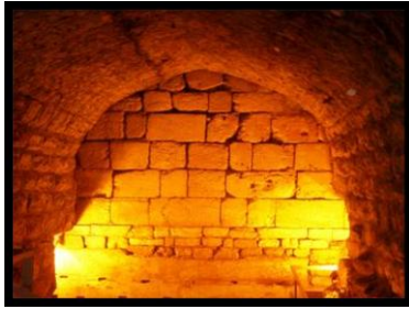
Western Wall Tunnels