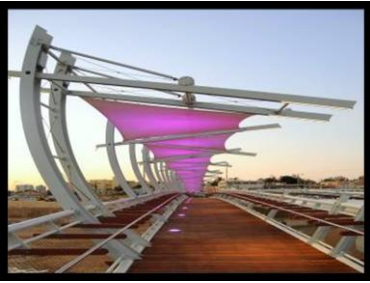
Pipes Bridge in Be'er Sheva