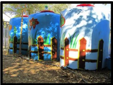
Rainwater Harvesting Program