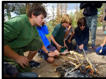
Green Horizons activity