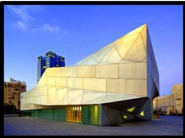
Tel Aviv Museum of Art