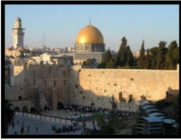
Old City of Jerusalem