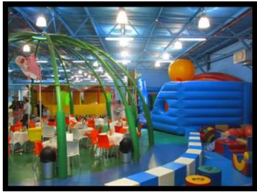
Sderot Indoor Recreation Center