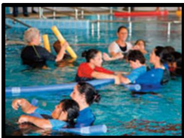
Hydrotherapy Pool at Aleh Negev