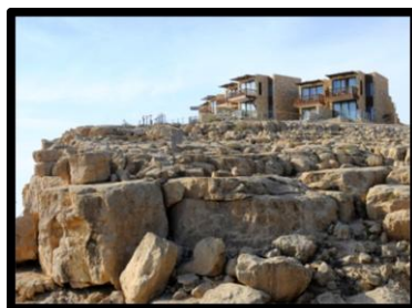
Beresheet Hotel overlooking the Ramon Crater

After checking out of the hotel, we'll head to a local organic farm to pick vegetables, fresh herbs, locally hatched eggs and other ingredients that we will then use to cook and prepare our own breakfast .